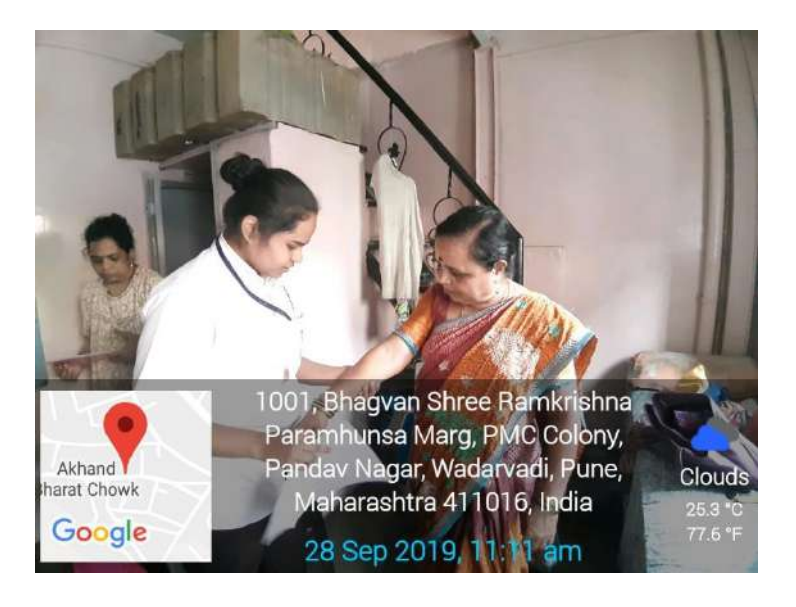
Assessment and identification of the cases