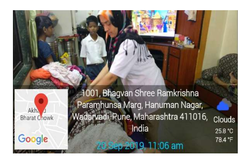
Assessment and identification of the cases