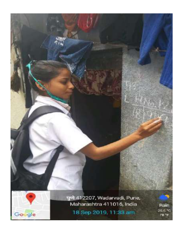
Marking of the houses